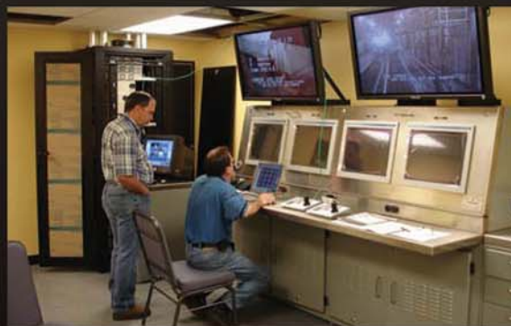
Camera Monitoring Systems